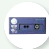
2Pin-22-28-8/4 mm, bipolar No. 20140-613