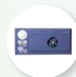
Multifunction No. 20140-630 (VIO 300 D only)