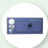
9/5 mm, monopolar No. 20140-620