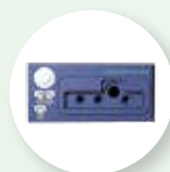
3Pin-Bovie, monopolar No. 20140-622