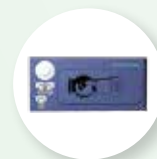
6 mm-2Pin patient plate No. 20140-642