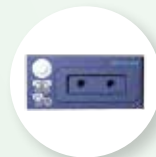
2Pin-22 mm, bipolar No. 20140-612