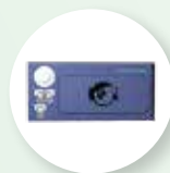
2Pin patient plate No. 20140-641