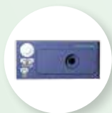
6 mm patient plate No. 20140-640