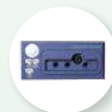
3Pin-9/5 mm, monopolar No. 20140-623